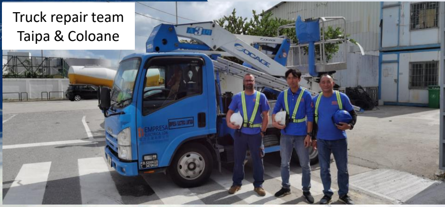
Truck repair team Taipa & Coloane