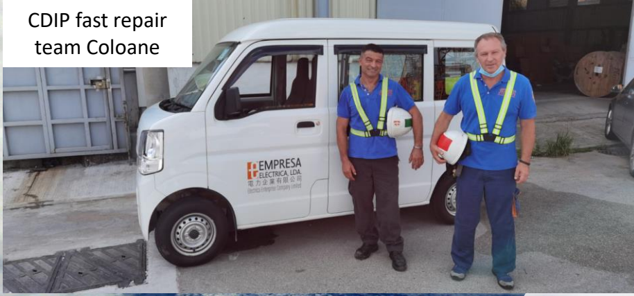
CDIP fast repair team Coloane