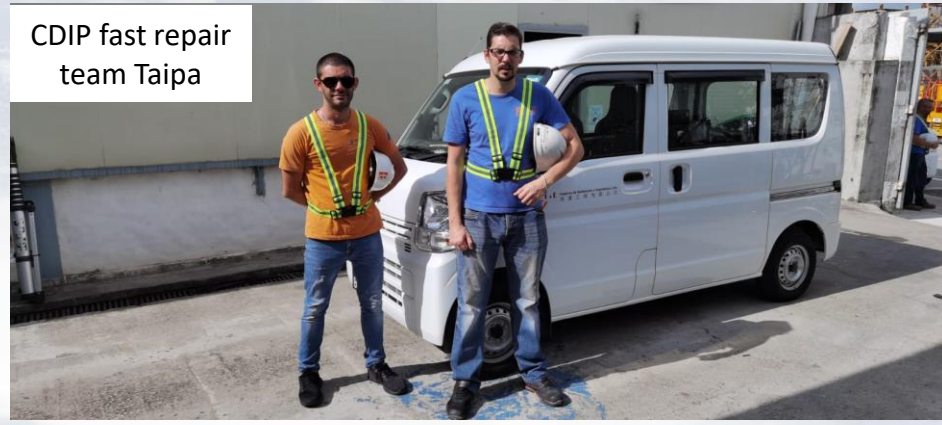
CDIP fast repair team Taipa